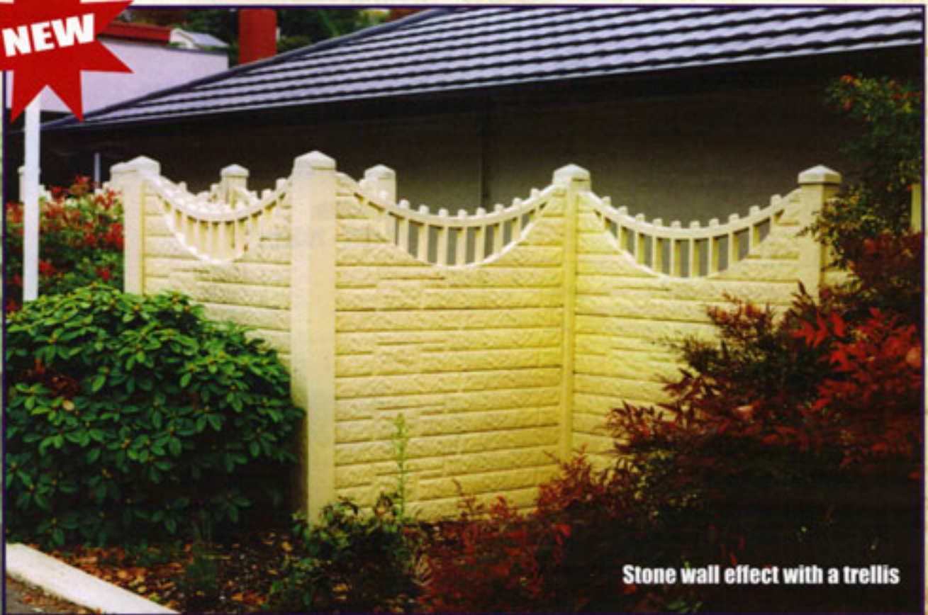
Stone wall effect with a trellis